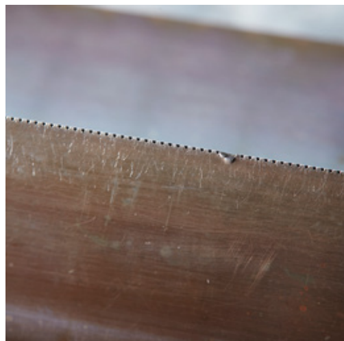
Example of a meltblown spinneret in before/after comparison

Talk to us – we will be happy to advise you.